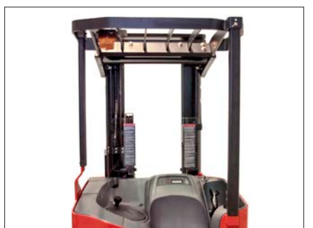
Universal Stack-Stance Configuration